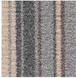
TUFTEX TWIST STRIPE 93