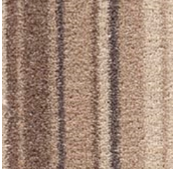
TUFTEX TWIST STRIPE 33