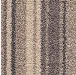
TUFTEX TWIST STRIPE 38