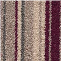
TUFTEX TWIST STRIPE 41