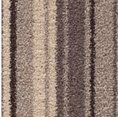
TUFTEX TWIST STRIPE 35