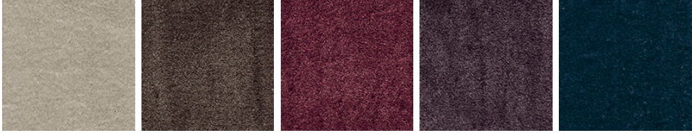
RADIANT 90 RADIANT 44 RADIANT 19 RADIANT 17 RADIANT 78