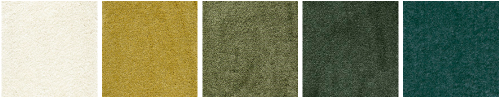
RADIANT 05 RADIANT 54 RADIANT 21 RADIANT 24 RADIANT 73