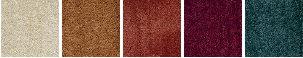
RADIANT 34 RADIANT 48 RADIANT 84 RADIANT 10 RADIANT 28