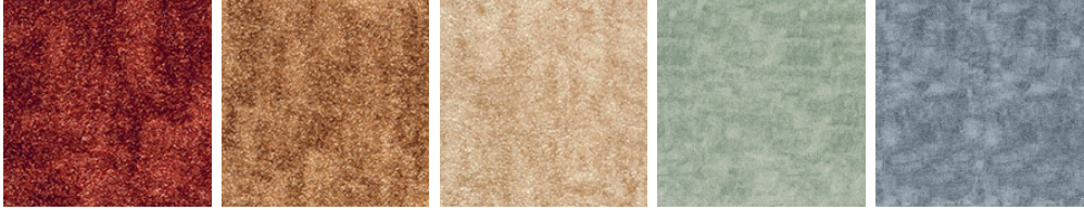
POZZOLANA 84 POZZOLANA 38 POZZOLANA 30 POZZOLANA 20 POZZOLANA 75